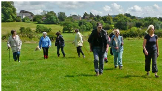
Walkers striding out in the beautiful countryside surrounding Hempsted.

We hope that the festival will become an annual event so hopefully next year will be bigger and better!