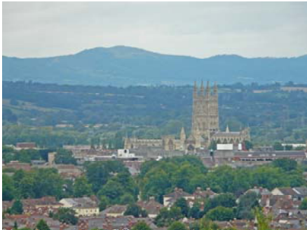
The view from Robinswood Hill on August 14th.