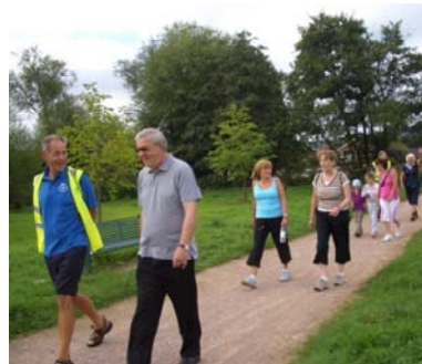
Abbeydale walkers walking and talking on August 11th.